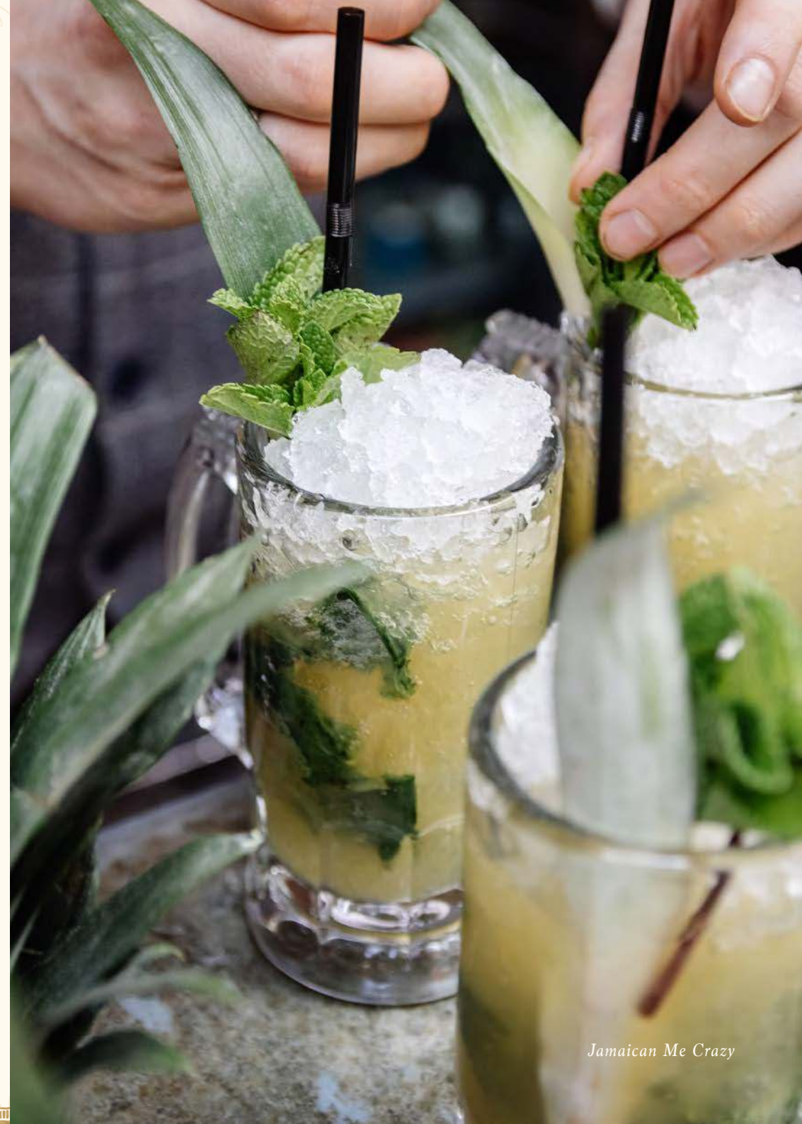
Jamaican Me Crazy

Caribbean rum syrup (non-alcoholic), pineapple juice, lime juice and fresh mint