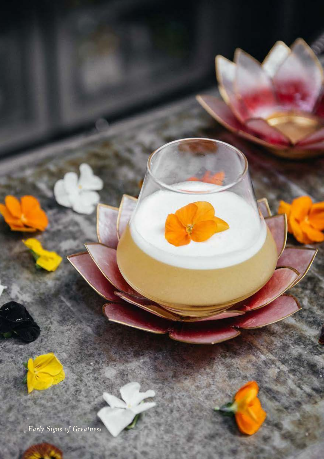
Early Signs of Greatness